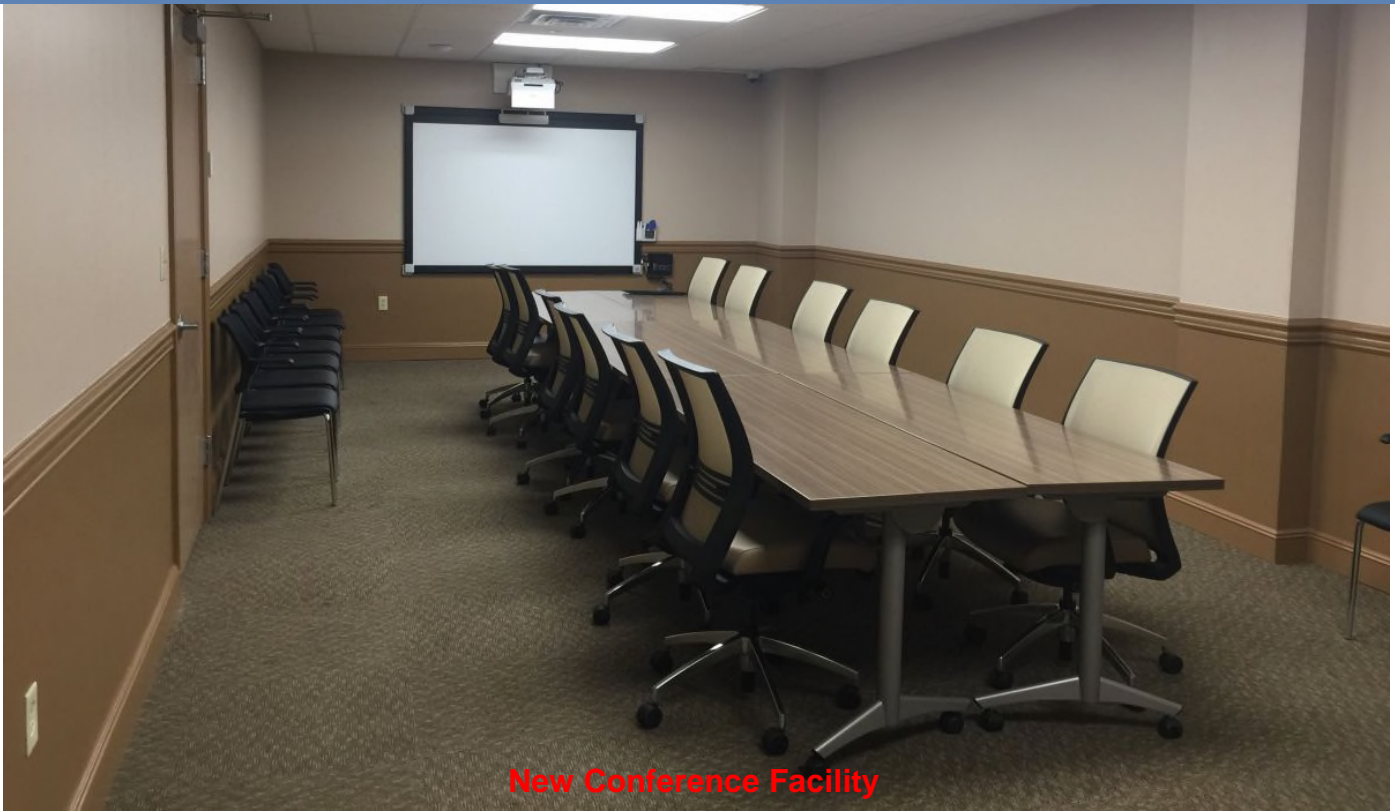
New Conference Facility